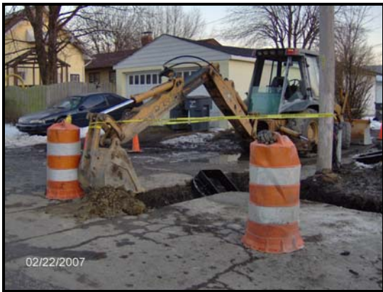
South Bayou of Bosart, March 22, 2007