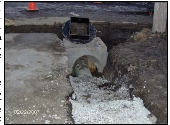
North Bayou of Bosart, March 22, 2007