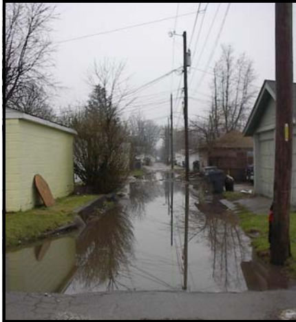
South Bayou of Bosart, March 12, 2006

I think that everyone in Emerson Heights is familiar with the Bayous of Bosart. That wonderful fishing spot on St. Clair Street between Bosart and Drexel Avenues.