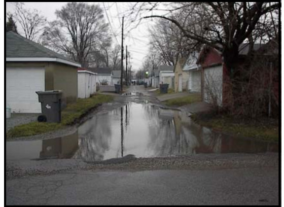
North Bayou of Bosart, March 12, 2006