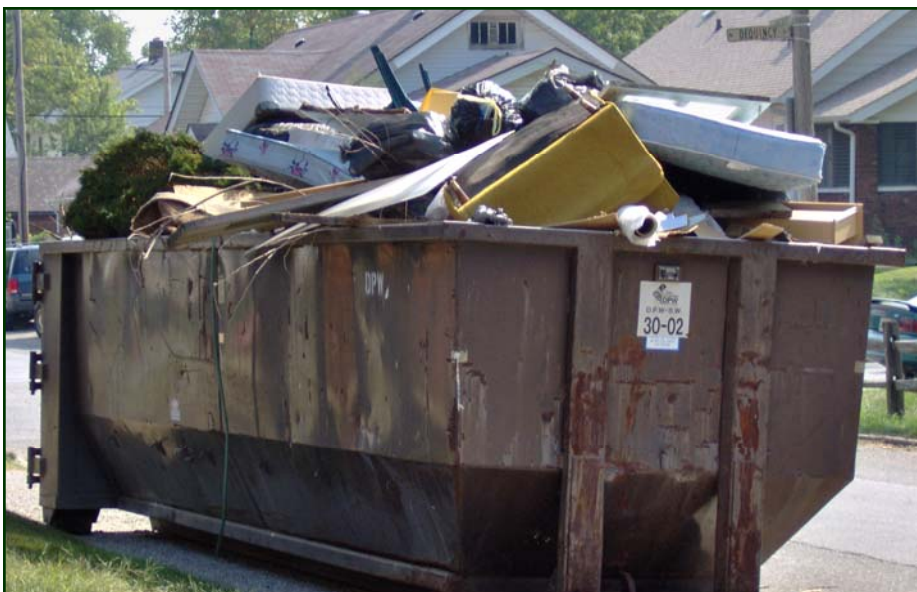
A full dumpster shows the efforts of volunteers to Keep EH Beautiful.